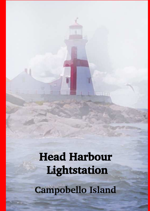
Head Harbour Lightstation Campobello Island

210 Lighthouse Road Wilson's Beach, NB E5E 1M2 Canada